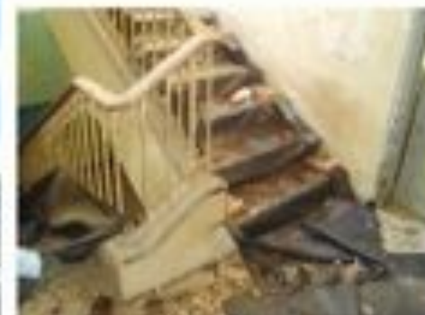
THE BUILDING views of the interior